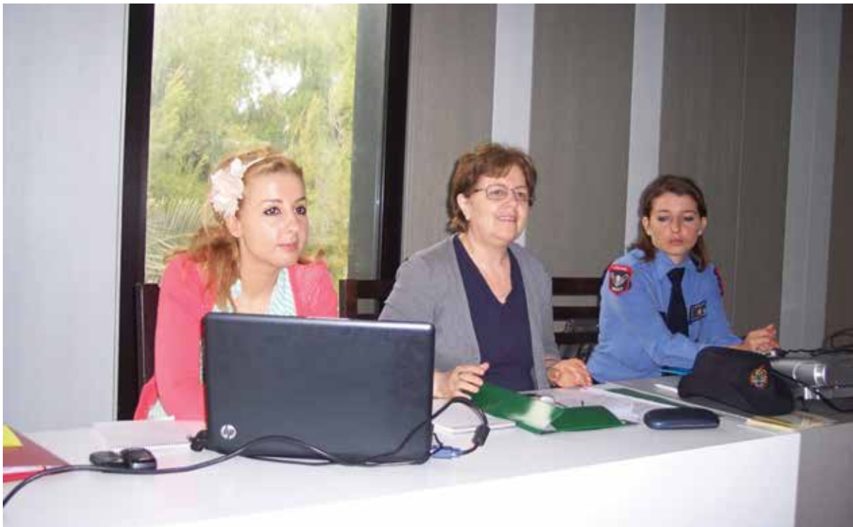
Photo from activities organized during 2013 in Vlora, under the frame of the implementation of the project “Strengthening of the partnership police-youth and increasing the level of cooperation of police with community and other responsible actors in Vlora”, implemented from CLCI, under the frame of the Swedish Support to the Ministry of Interior (Mol) and the Albanian State Police (ASP) on Community Policing programme.

Photo from the Round Table with theme “The aspects of implementation of the Albanian legislation and international standards in gender perspectives, in Durres Judicial District Court”, organised in Durrës, on October 14, 2013, under the frame of the project “Pursuing Strategic Litigation Cases to Advance Women’s Human Rights and Increase their Access to National and International Protection Bodies”, implemented from CLCI, with the support of United Nations Development Program and the Swedish government.