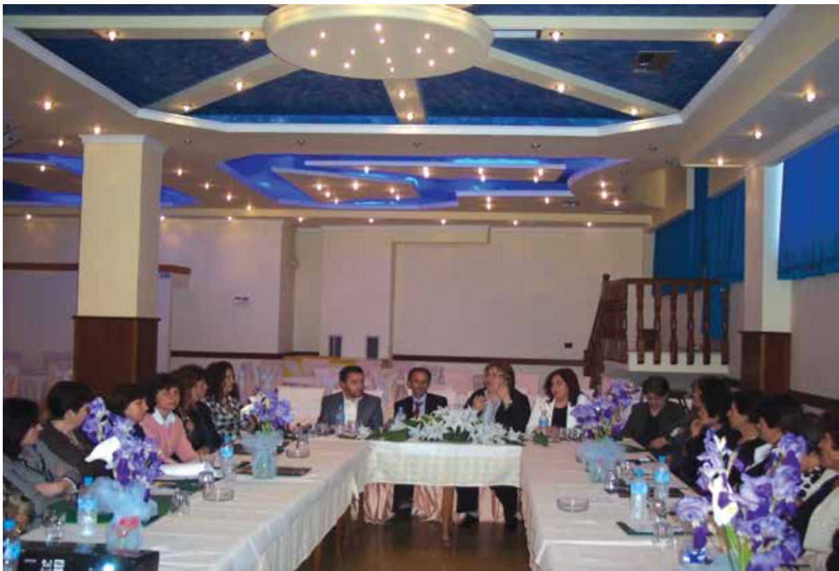
Photo from the Round Table organized with different actors in Preza, on April 24, 2013, under the frame of the project, “The implementation of the law ‘On protection from Discrimination’”, implemented from CLCI, with the support of the Democracy Commission Small Grants Program of USA Embassy in Tirana.

Photos from the activities organized from the Center for Legal Civic Initiatives during the period 2013-2014.