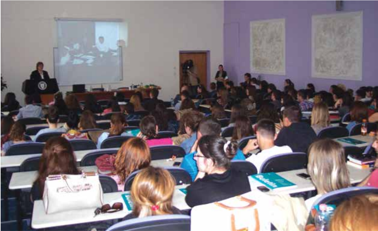
Photo from the activity of the winners announcement in the competition “The most successful essays related to the implementation of anti discrimination legislation”, organised in Tirana on May 9, 2013, under the frame of the project, “The implementation of the law ‘On protection from Discrimination’”, implemented from CLCI, with the support of the Democracy Commission Small Grants Program of USA Embassy in Tirana.