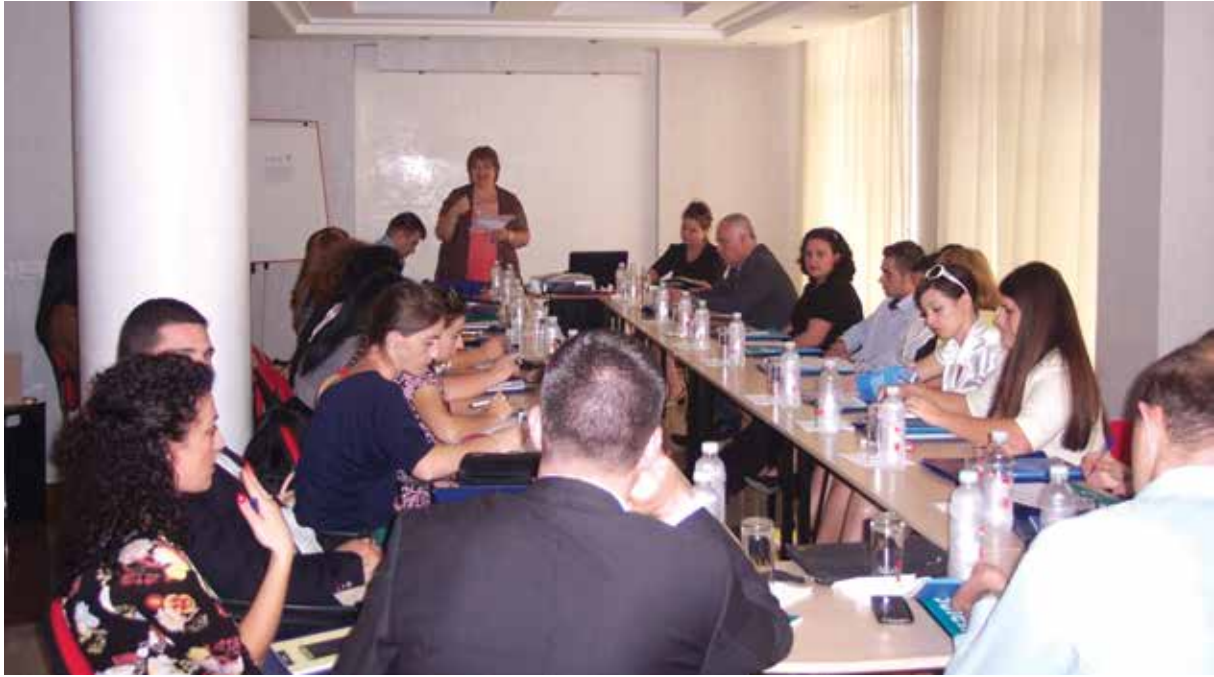
Photo from the Round Table with theme “The aspects of implementation of the Albanian legislation and international standards in gender perspectives, in Durres Judicial District Court”, organised in Durrës, on October 14, 2013, under the frame of the project “Pursuing Strategic Litigation Cases to Advance Women’s Human Rights and Increase their Access to National and International Protection Bodies”, implemented from CLCI, with the support of United Nations Development Program and the Swedish government.