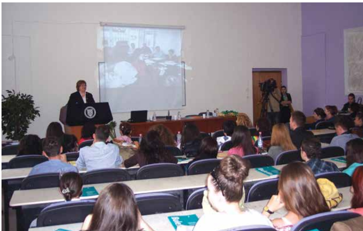
Photo from the activity of the winners announcement in the competition “The most successful essays related to the implementation of anti discrimination legislation”, organised in Tirana on May 9, 2013, under the frame of the project, “The implementation of the law ‘On protection from Discrimination’”, implemented from CLCI, with the support of the Democracy Commission Small Grants Program of USA Embassy in Tirana.