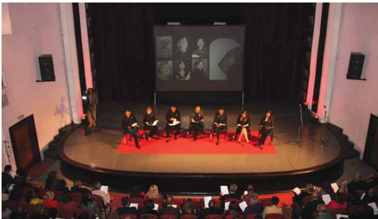
Photo from the performance “Seven”, organised from CLCI on November 8, 2013, with the support of Swedish Embassy in Tirana, HEDDA Produktion AB, Civil Rights Defenders, Swedish Institute dhe Vital Voices Global Partnership.