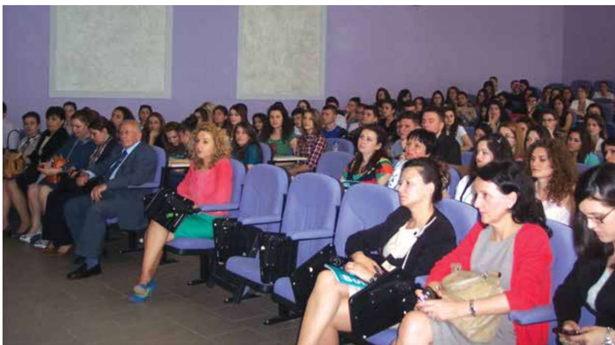
Photo from the activity of the winners announcement in the competition “The most successful essays related to the implementation of anti discrimination legislation”, organised in Tirana on May 9, 2013, under the frame of the project, “The implementation of the law ‘On protection from Discrimination’”, implemented from CLCI, with the support of the Democracy Commission Small Grants Program of USA Embassy in Tirana.