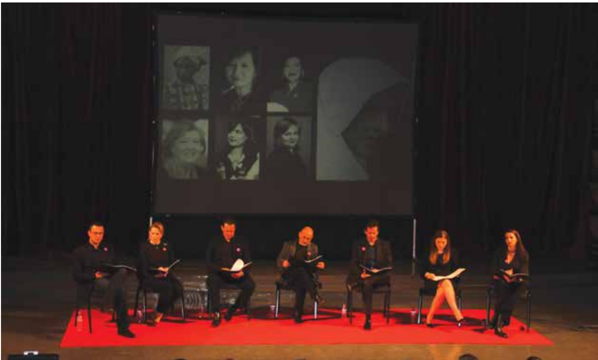
Photo from the performance “Seven”, organised from CLCI on November 8, 2013, with the support of Swedish Embassy in Tirana, HEDDA Produktion AB, Civil Rights Defenders, Swedish Institute dhe Vital Voices Global Partnership.